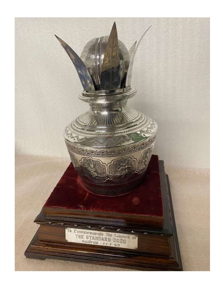
Standard 2000 trophy

The vase's dramatic top is reminiscent of a lotus, the national flower of India. The large central seed pod acts as a stopper at the top of the vase, with decorative leaf blades surrounding it and fixed along the inside of the neck. The outside of the vase has been engraved and pressed with motifs from the Hindu religion, including images of various deities including Vishnu (four arms), Krishna (holding a flute), Rama (with a bow and arrow)