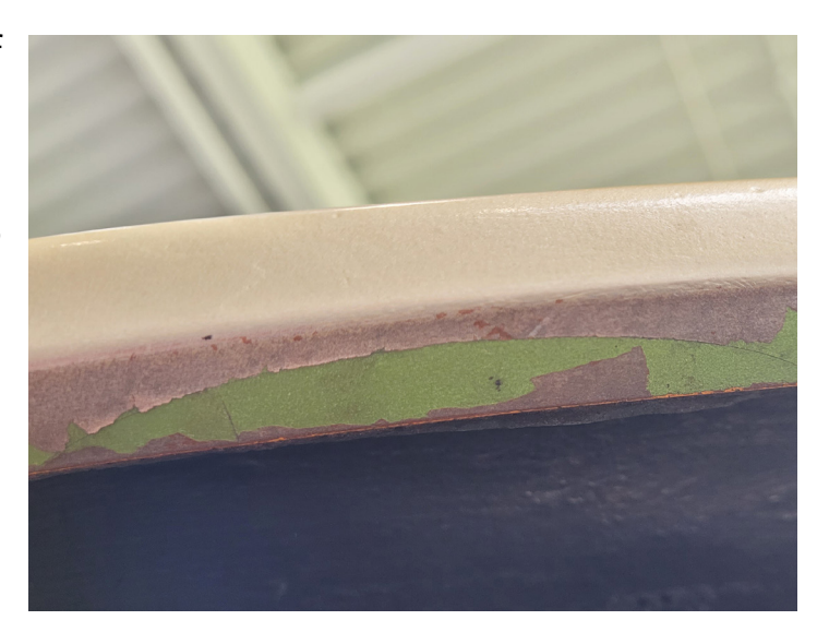
Up on the ramp, glimpses of green are revealed!

"Every day is a school day" as they say and creates another conundrum for the team. Should Zanda be returned to its original colour scheme as the designer intended? The thin end of the wedge, indeed!